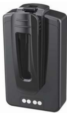
Mobile Lite-R29 with Belt Clip

Neck Lanyard: Nylon Material Total Length: 80 cm