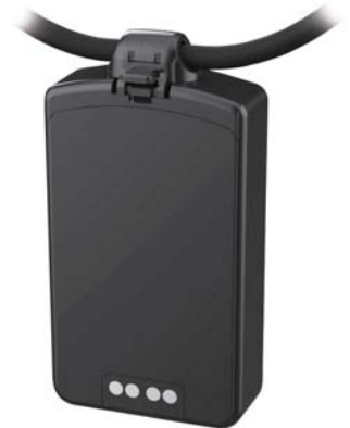
Mobile Lite-R29 with lanyard